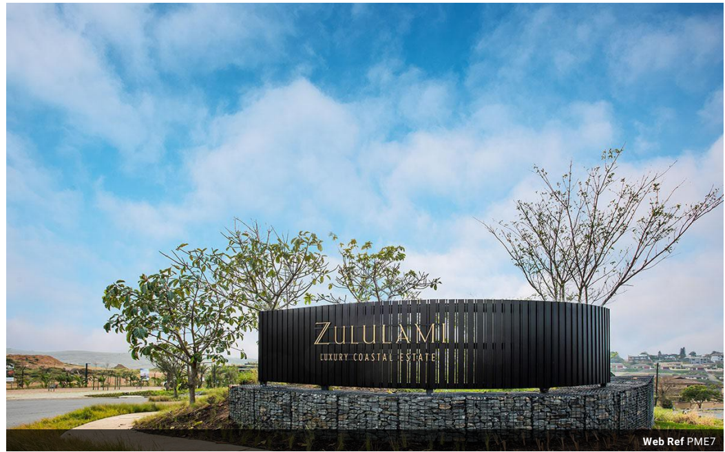
Web Ref PME7

Douglas Crowe Drive, Ballito, 4420 - 14 Silverstone Way